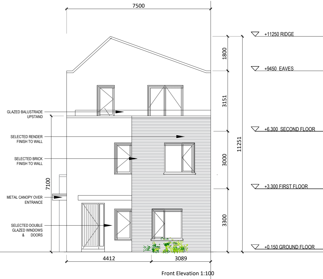
Front Elevation 1:100