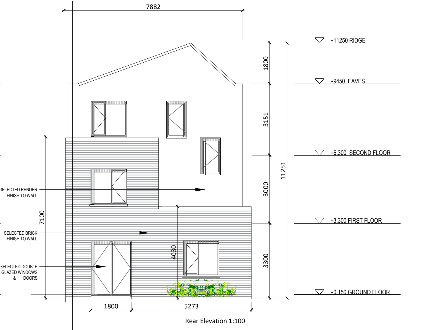
Rear Elevation 1:100